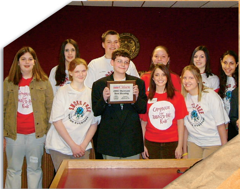
Students in Mexico, Missouri, are fighting secondhand smoke.

Taking Action The students next partnered with the Audrain County Team, a group that works against substance abuse, to help get their message out to the community. In a brochure that they wrote and distributed to medical offices, they included some of these facts, such as, "If you sit in a restaurant for two hours that allows smoking, you have smoked two cigarettes!" and information about cancer risks. In addition to their brochure, the students recorded radio announcements, wrote articles for the local newspaper, created anti-smoking stickers for restaurants to put on customers' bills, and visited smoke-free restaurants to award "thank you" certificates. The students' work continues; they hope that the City Council will pass a law banning smoking in all city restaurants. As they work toward that goal, the teens are collecting signatures in support of the law, drafting a sample law for the council, and informing local company owners that smoking may be bad for business.